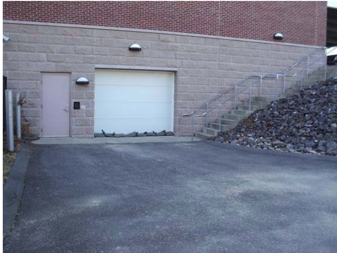
Surface Runoff Enters Through Garage Door (Sandbags Required)