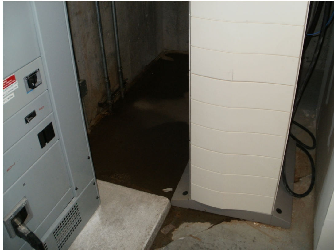
Water in Electrical Room Solar Equipment and Main Electrical Panel