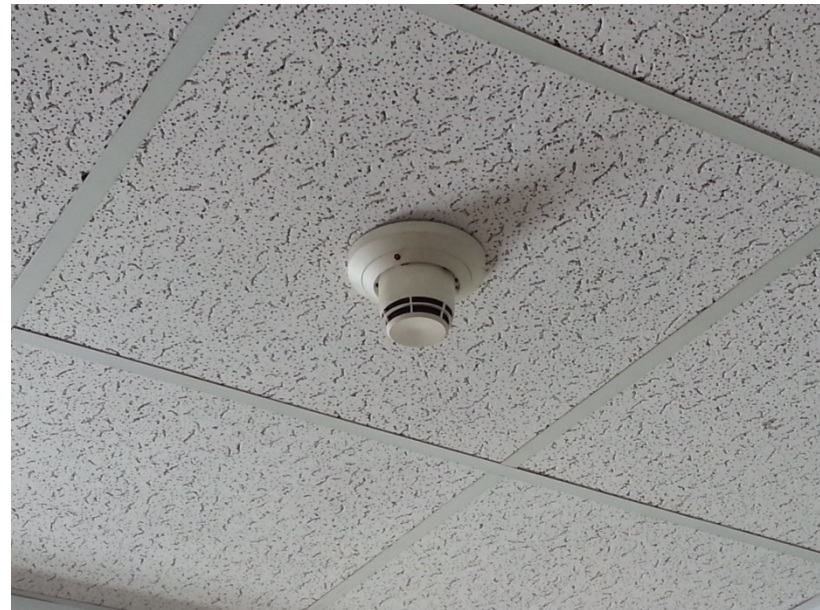
Fire Alarm System Components Upgrade