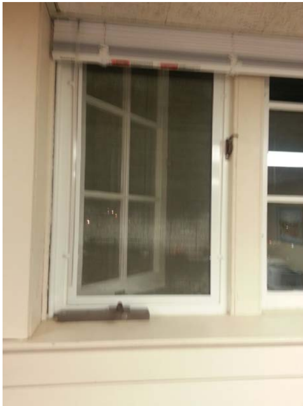
Window AC Units on 3 rd Floor Not Useable with New Historical Appropriate Windows