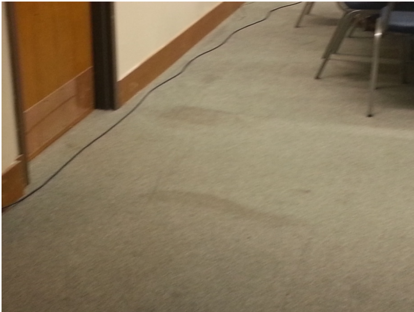
Stained Carpets Throughout Need Replacing