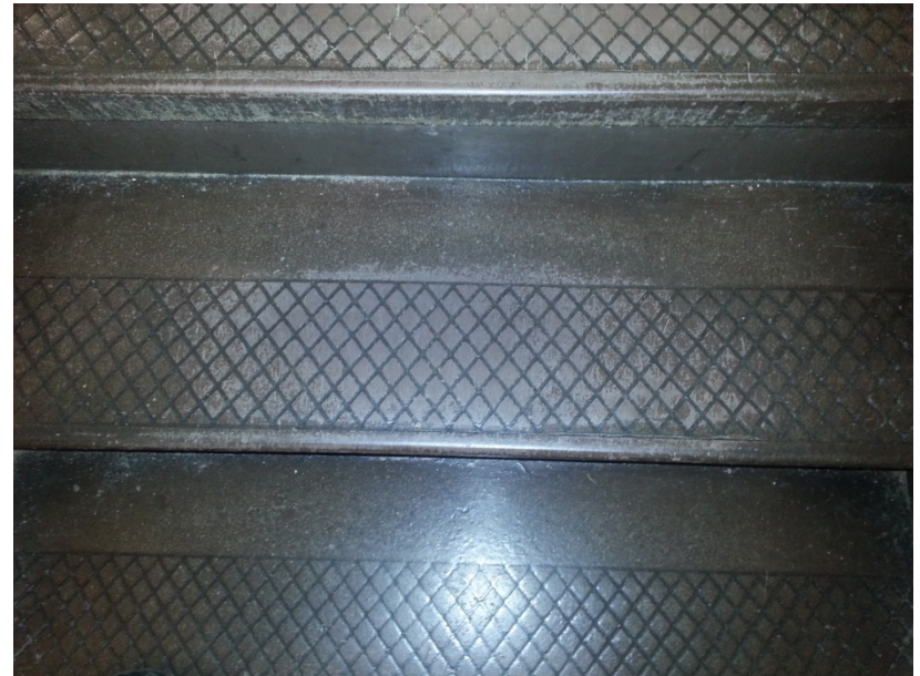
Stair Treads Worn, Cracked and Broken Need Replacing