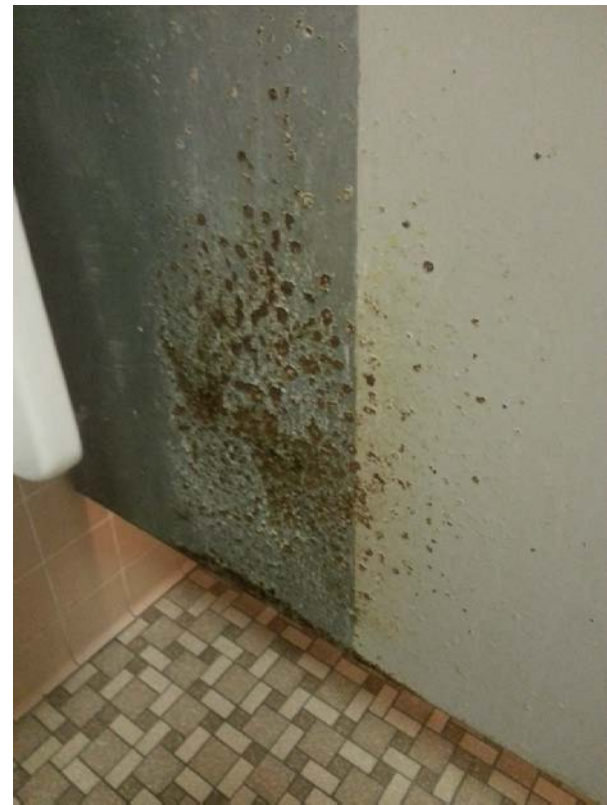
Bathroom Partitions Throughout Need Replacing